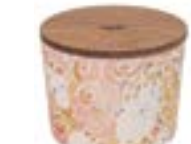
Patterned Candle 23 oz / 655 g Case Pack of 4 - May Assort

Our NEW Patterned Candles boast three wicks, an even, clean burn, and our beautiful patterns wrapped around a bamboo fiber and melamine container that can be easily repurposed after burning.