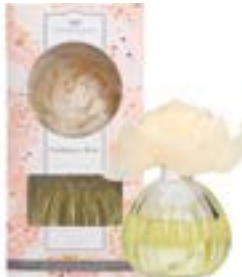
Flower Diffuser 8.0 fl oz (236 g) Case Pack of 4 available in Bella Freesia, Brambleberry, Cashmere Kiss, Citron Sol, Classic Linen, Garden Thyme, Grandiflora, Guava Gloss, Haven, NEW! Hope, Indigo Suede, Lavender, Magnolia, Merry Memories**, Orange & Honey, Peony Bloom, NEW! Rhubarb & Oak, Roses, Saffron & Silk, Seaspray, Shimmering Snowberry**, Silver Spruce**, Spa Springs, Tuscan Vineyard, Vanilla Dream and NEW! Willow & Sage! ** Seasonal Fragrances Ship Only June 1- Dec 15