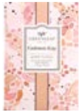
Large Sachet 7.0 Cu In (115 ml) Case Pack of 18 available in all fragrances