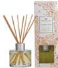
Signature Reed Diffuser 4.0 fl oz (118 ml) Case Pack of 4 available in all fragrances