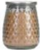
Signature Candle 13 oz | 369 g 90-100 Hour Burn Time Case Pack of 4 available in all fragrances