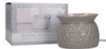
Electric Warmer Case Pack of 1

available in Bella Freesia, Cashmere Kiss, Classic Linen, Haven, NEW! Merry Memories, Orange & Honey, New! Shimmering Snowberry and NEW! Silver Spruce!